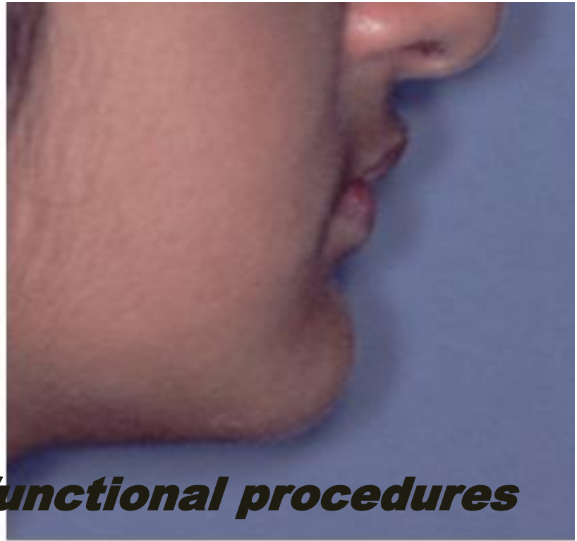
Correction of jaws by functional procedures