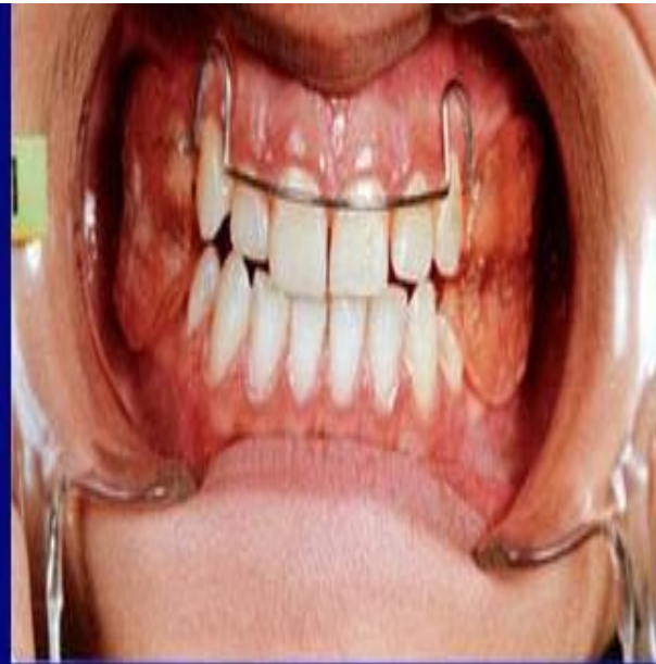
During Treatment By Functional Appliances