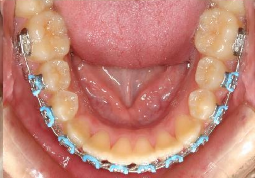
Correction of malalignment